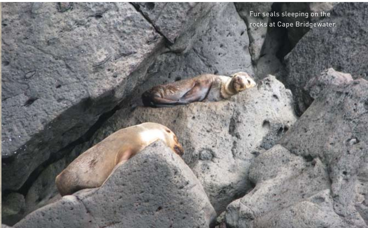
Fur seals sleeping on the rocks at Cape Bridgewater.

In the 1970s, the Gunditjmara again sought to have the mission and mission lands at Lake Condah returned to them.